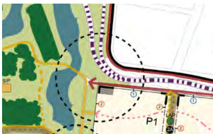
Figure 5.93: Extract from the Regulatory Plan