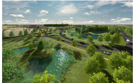
Figure 5.94: Aerial view of the Northern Gateway (see Section 4.2.1)

The landscape setting that this key grouping is responding to is described in Section 4.2.1.