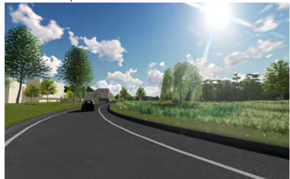
Figure 5.95: Street level view of the approach to the first junction