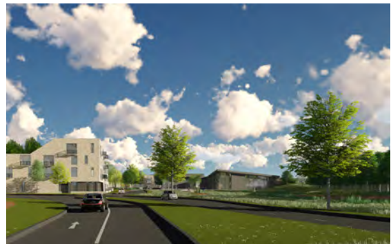
Figure 5.96: Street level view close to the first junction